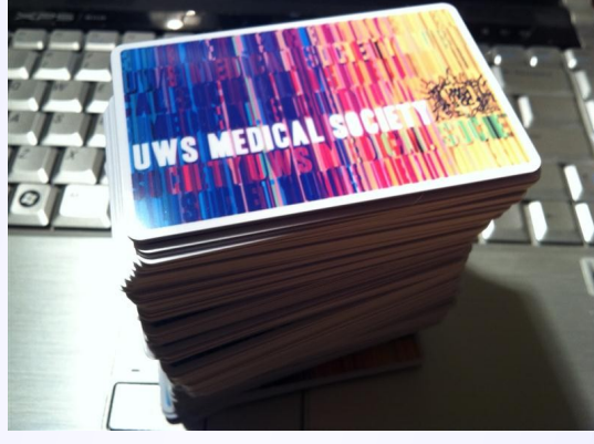
These cards are lonely and waiting for your wallet